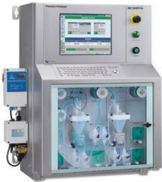
Figure 2. ADI 2045TI Ex proof (ATEX) Analyzer.

Chloride is analyzed with conductivity detection as described in ASTM D3230 with the ADI 2045TI Ex proof Analyzer ( Figure 2 ).