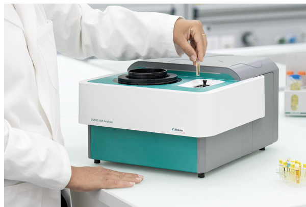
Figure 1. OMNIS NIR Analyzer and a sample filled in a disposable vial.

Samples of diesel with varying water content (from 66 to 362 mg/L) were measured with an OMNIS NIR Analyzer Liquid in transmission mode (1000–2250 nm). Reproducible spectrum acquisition was achieved using the built-in temperature control. For convenience, disposable vials with a pathlength of 8 mm were used, which made cleaning of the sample vessels unnecessary. The OMNIS software was used for all data acquisition and prediction model development.