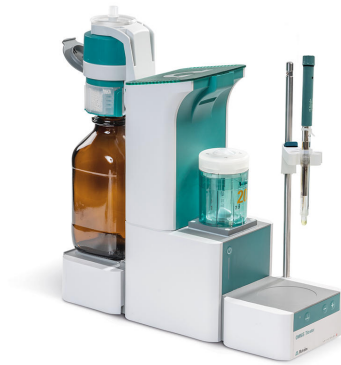
Figure 1. OMNIS Professional Titrator equipped with a dUnitrode with integrated Pt1000.

An appropriate amount of water is pipetted into the titration beaker. After pH measurement, the p- and m-values are determined with fixed endpoints (FP) at pH 8.2 and 4.5 using standardized hydrochloric acid.