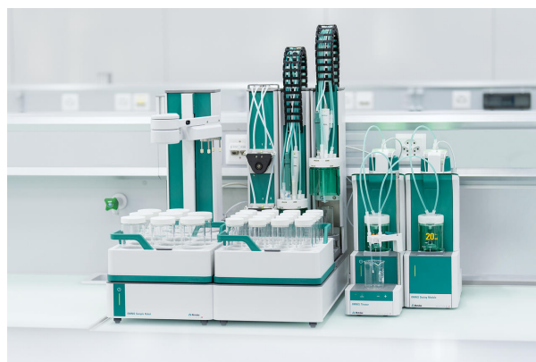
Figure 1. OMNIS Sample Robot S equipped with an OMNIS Titrator, OMNIS Dosing Module, and dSolvotrode for the automated determination of TAN and TBN in motor oil samples.

One exemplary titration curve of TBN with \text{HClO}_4 is shown in Figure 2 .