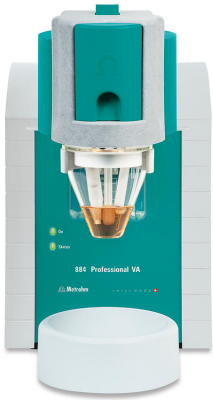
Figure 1. 884 Professional VA manual for MME.

Add 10 mL oxidized sodium chloride brine sample and 2 mL of ultrapure water into the measuring vessel. The determination of iodide is carried out with the 884 Professional VA (Figure 1) using the parameters specified in Table 1. The concentration is determined by two additions of iodate standard addition solution.