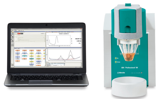
Figure 1. 884 Professional VA.

After diluting the sample in electrolyte, the polarographic determination of iodate is carried out on the 884 Professional VA with the Multi-Mode Electrode pro as working electrode using the parameters listed in Table 1. The concentration of iodate is determined by two additions of standard addition solution.