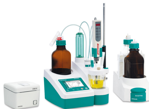
Figure 1. Eco KF Titrator equipped with a Polytron, a Solvent Pump, and a double Pt-wire electrode for volumetric Karl-Fischer titration.

An appropriate volume of sample is injected into the sample beaker and the sample size is weighed back. Alternatively, the sample can also be weighed in directly. However, the solution is homogenized with the Polytron and titrated with standardized Karl Fischer titrant to the endpoint.