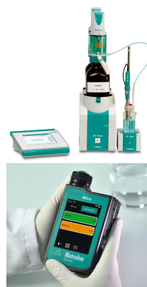
Figure 1. The 907 Titrando (top) and MIRA XTR (bottom) from Metrohm were used for simultaneous collection of pH and Raman data.

Raman data was collected from the top surface of the solution. Alternatively, Raman data can also be acquired directly from the solution using an immersion attachment or through the titration vessel's glass wall.