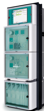
Figure 2. 2060 Process Analyzer for photometric measurements of ultratrace iron and copper in the water-steam circuit of power plants.

The continuous online ultratrace analysis of Fe and Cu in the water-steam circuit of power plants is possible using the 2060 Process Analyzer (Figure 2) from Metrohm Process Analytics. This automated process analysis system enables early detection of corrosion processes and peaks, and also monitors the formation and destruction of the protective oxide layer ( Figure 3 ). Continuous analyses also signal a problem before dissolved metals can reach the condensate stream and thus the turbine blades where they would cause damage. In combination with the power plant's Distributed Control System (DCS), online monitoring of Fe and Cu ensures that corrosion can be controlled before it affects the power plant efficiency, ultimately decreasing downtime and lowering maintenance costs.