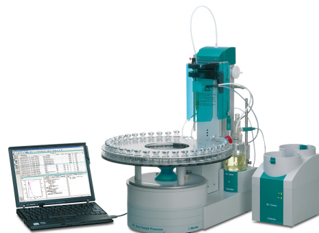
Figure 1. The 874 Oven Sample Processor, 851 Titrand and coulometric titration cell, all controlled by tiamo software.

This analysis is carried out on an automated system consisting of an 874 Oven Sample Processor and an 851 Titrand equipped with a coulometric titration cell (Figure 1).