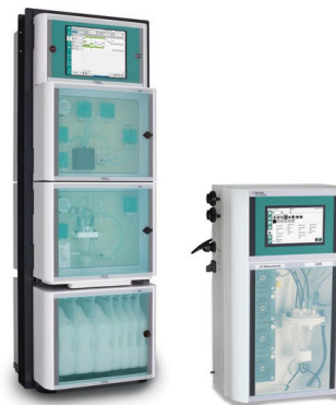
Figure 3. Some of the Metrohm Process Analytics analyzers capable of determining the ammonia concentration online. Left: 2060 Process Analyzer, right: 2026 Titrolyzer.