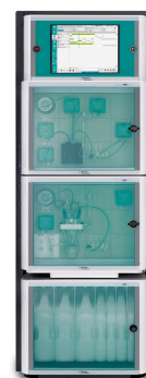
Figure 2. 2060 Process Analyzer.

In order to extract the proper compounds, keep the pH within specifications, and brew the same flavors over multiple batches, both alkalinity and hardness of the process and make-up water must be monitored and kept at proper levels. The Metrohm Process Analytics 2060 and 2035 Process Analyzers ( Figures 2 and 3 ) are ideally suited for the fully automatic execution of these important analyses, as well as additional parameters like pH or conductivity. The process analyzer can send an alarm to the plant control system if alkalinity or hardness levels are not optimal, signaling the distribution control to correct the water chemistry, ensuring consistent product quality.