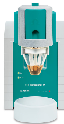
Figure 1. 884 Professional VA manual for MME.

Add 10 mL acetic acid sample and then 2 mL ultrapure water into the measuring vessel. Carry out the determination of iodide using the 884 Professional VA (Figure 1) and the parameters specified in Table 1. The concentration is determined by two additions of iodide standard addition solution.