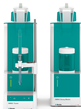
Figure 1. OMNIS titrator with the digital pH electrode and a dosing module.

Aliquots of the blank and sample were titrated against hydrochloric acid solution until after the last equivalence point (Figure 2).