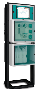
Figure 3. 2060 VA Process Analyzer from Metrohm Process Analytics.

Employing voltammetric determination, the 2060 VA Process Analyzer ( Figure 3 ) operates fully automatically. It also features an alarm system that notifies plant personnel when any of the monitored heavy metals approach the limit values. This timely alert enables the introduction of ion exchanger regeneration or other strategies for mitigation, effectively preventing limit value breaches.