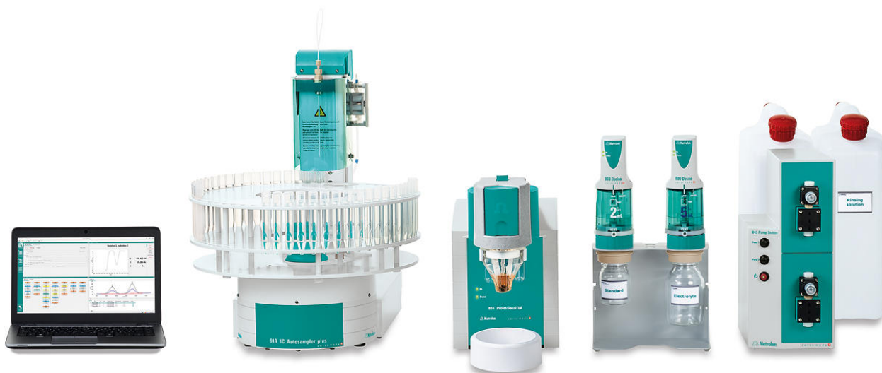
Figure 1. 884 Professional VA fully automated for VA