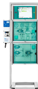
Figure 2. 2060 TI Ex Proof Process Analyzer, suitable for ASTM D8045.

The 2060 TI Ex Proof Process Analyzer (Figure 2) can monitor acidity of crude oil according to ASTM D8045 testing procedures. By monitoring the acidity of crude oil and associated products, billions of dollars are saved annually by avoiding unexpected shutdowns and preserving expensive treatment chemicals.