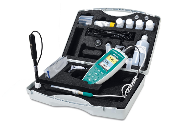
Figure 1. Transport case including all accessories and a 914 pH/DO/Conductometer equipped with an O 2 -Lumitrode and conductivity sensor for the determination of dissolved oxygen in a freshwater stream.

This analysis is carried out on a 914 pH/DO/Conductometer equipped with an O 2 -Lumitrode and a conductivity measuring cell to compensate for the higher salinity. Both sensors are calibrated before the measurement. The sensors are both directly inserted into the surface water at the point of interest, to a depth of at least 3.5 cm.