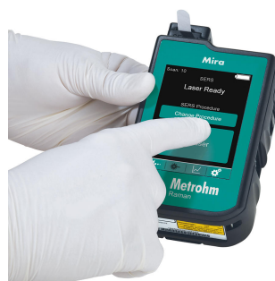
Figure 1. SERS is easily implemented on any 785 nm Raman instrument with dedicated substrates. Metrohm's MIRA XTR and P-SERS substrates are a convenient, portable, and sensitive solution.

Methyl mercaptan (MM; 2,000 mg/L in toluene) was serially diluted with paraffin oil. Dilute samples (5 \mu\text{L} ) were applied to Metrohm's silver paper SERS (Ag P-SERS) substrates and allowed to rest for five minutes. After resting, SERS data was collected with MIRA XTR (Figure 1). Experiment samples and conditions are summarized in Table 1.