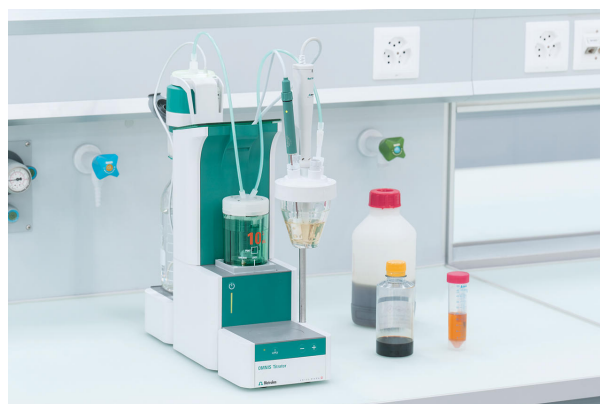
Figure 1. OMNIS Titrator setup for the thermometric titration. Data evaluation is performed with the OMNIS software.

An appropriate amount of sample is weighed precisely into the titration vessel. Deionized water is added to dissolve the sample, which is then titrated until after the exothermic endpoint with standardized STPB.