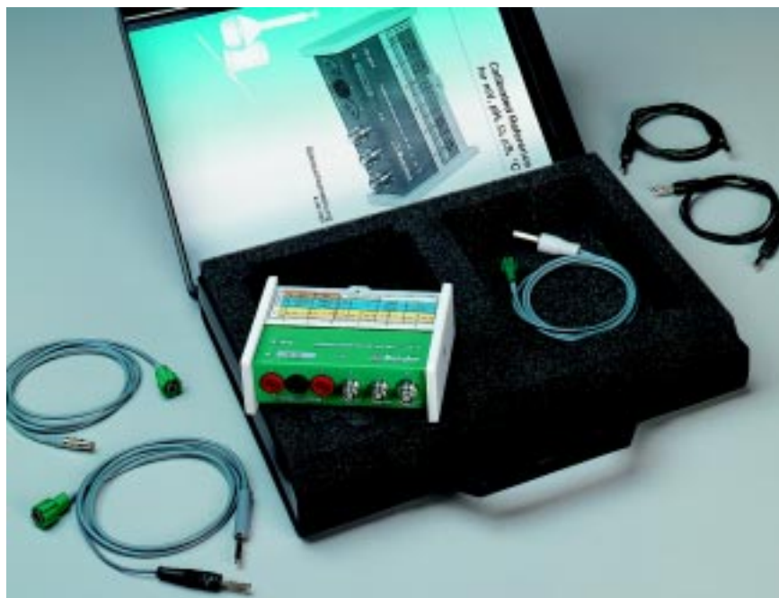
The 2.767.0010 in its practical case. The standard cables shown form part of the accessories.

When the solar cell is active the Calibrated Reference supplies two voltages. One of them has a value of approximately 1200 mV and is available either directly or via a 1 G \Omega resistor. The second voltage is about -340 mV, which corresponds to a pH value of 12.76 (25 °C, slope = 100%, pH as = 7.00).