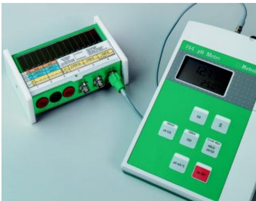
Checking the pH display of a 744 pH Meter with the Calibrated Reference.