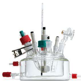
Figure 1 – The Metrohm Autolab 1 L corrosion cell.

A Metrohm Autolab PGSTAT302N was used, together with a Metrohm Autolab 1 L corrosion cell, shown in Figure 1.